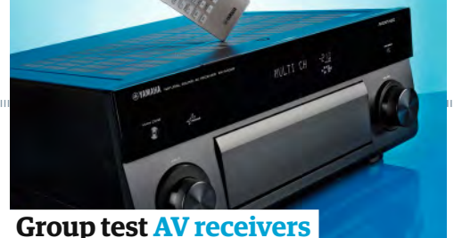
Group test AV receivers "It is nothing short of a powerhouse"